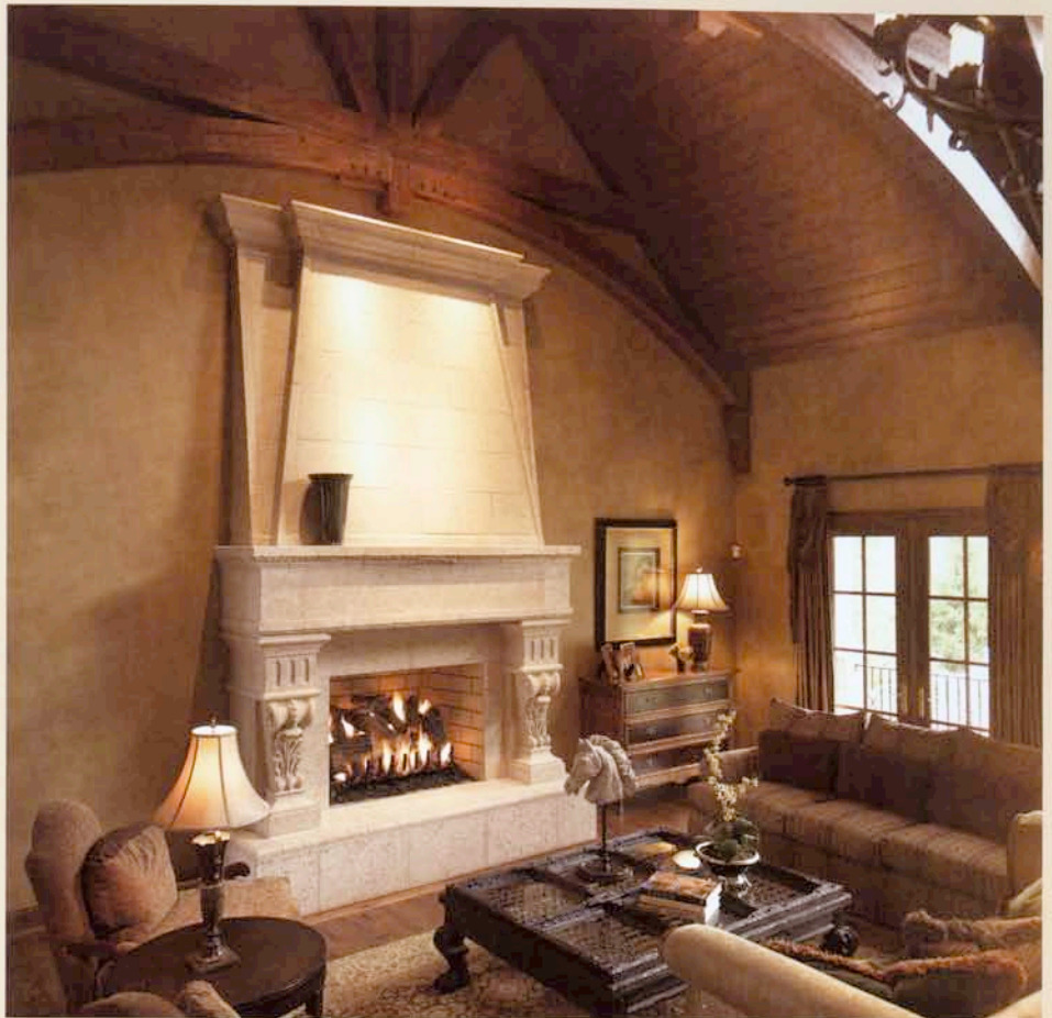
Above: The extraordinary level of workmanship in a Cambridge Home is highlighted in the impressive design of this fireplace and beautiful ceiling beams above. Below: A claw-foot tub and vanity with hutch create an old-world ambiance and charm to this main bath.