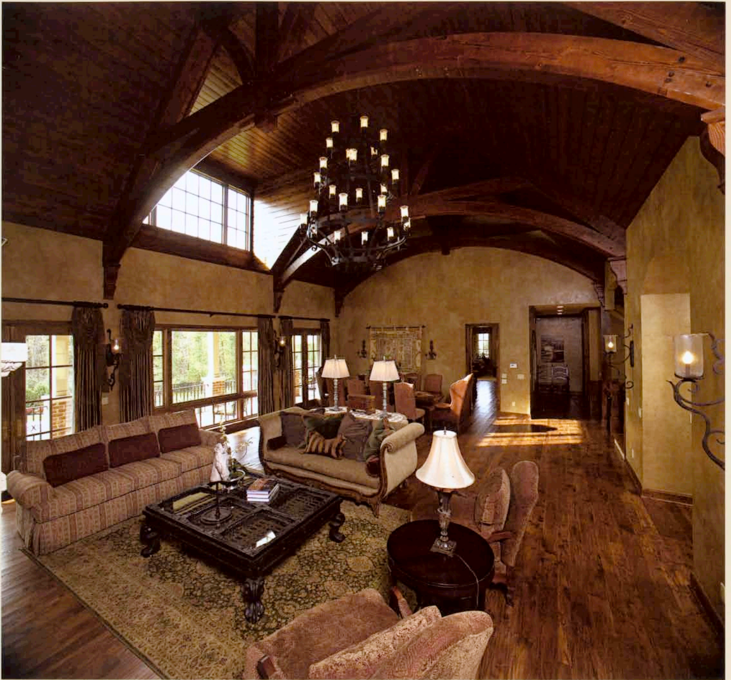
Design, detail and craftsmanship are hallmarks of every Cambridge Home.