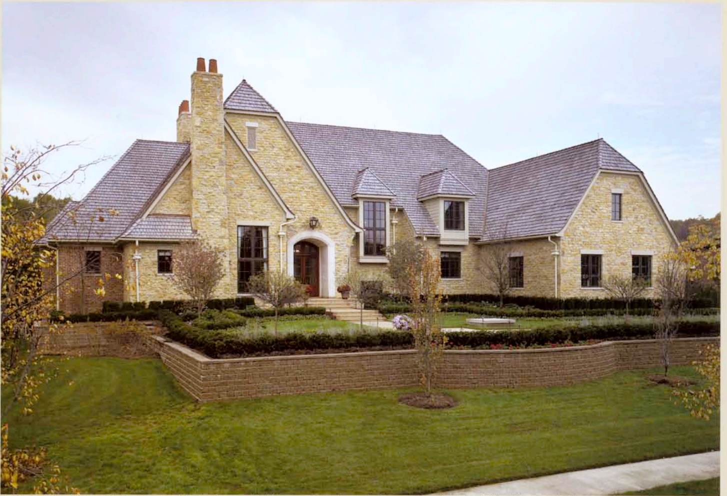
At Cambridge Homes, the process of designing and building each customer's dream home is an individual journey led by the company's experienced staff and team of construction experts.

leader in the premium niche of fine home and community development well into the coming century.