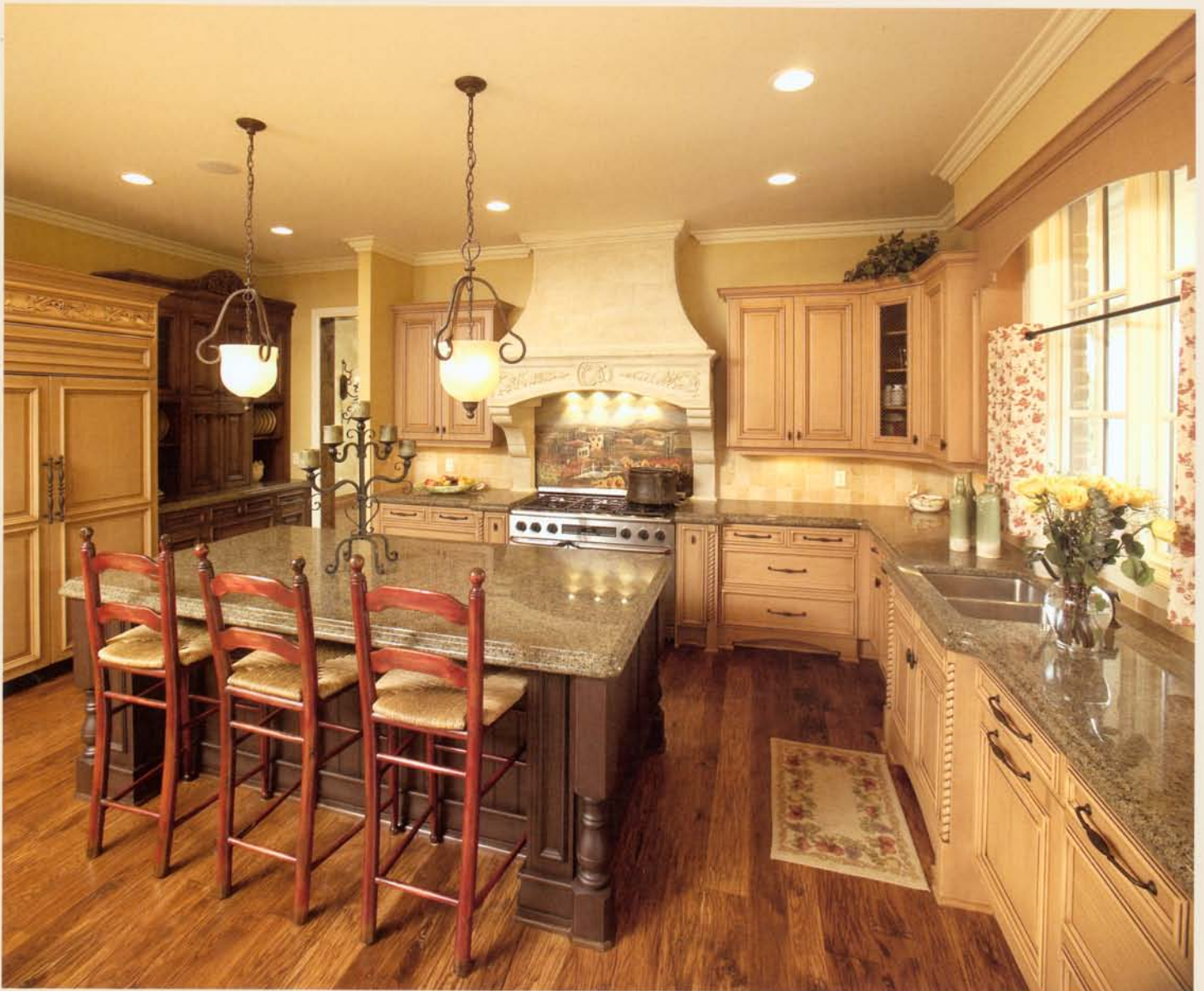
Whether entertaining or preparing a feast, the kitchen is the focal area of the home. This gorgeous gourmet kitchen features custom cabinetry, granite countertops, and a large preparation island.

one. Homebuilding can be a challenging process for the buyer, there are many decisions to be made along the way. We understand that this is someone's dream home and it is our job to guide them and ensure a successful, satisfying relationship and construction experience."